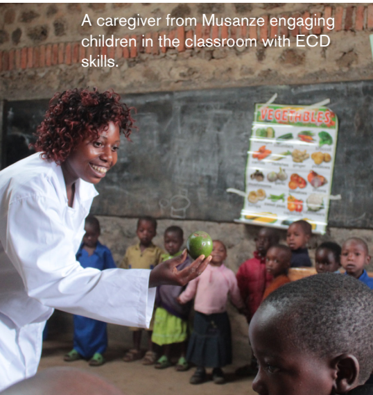
A caregiver from Musanze engaging children in the classroom with ECD skills.